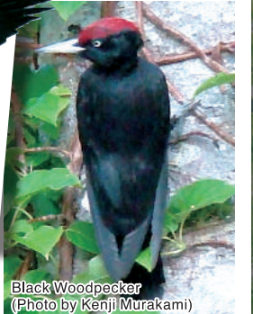
Black Woodpecker