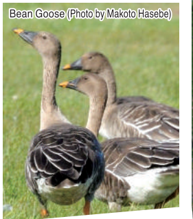
Bean Goose