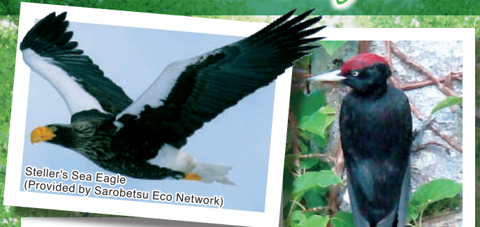
Steller's Sea Eagle