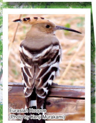
Eurasian Hoopoe