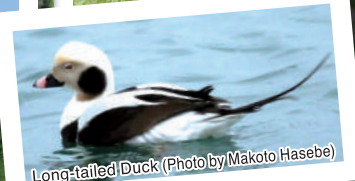
Long-tailed Duck