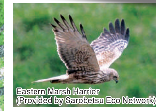
Eastern Marsh Harrier