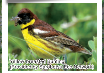
Yellow-breasted Bunting

Greater Kita Soya Area Tourism Promotion Association